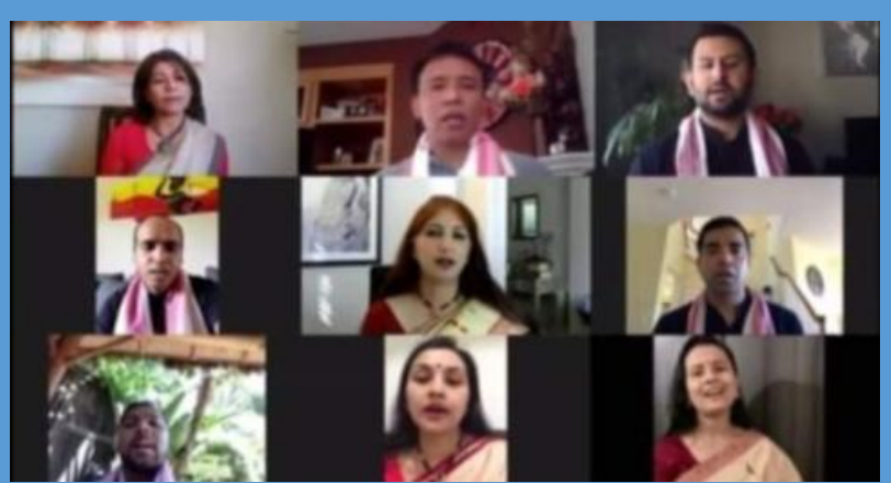
Closing ceremony: Chorus