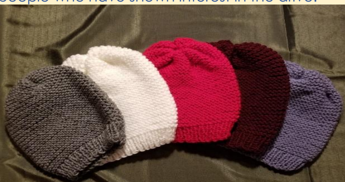
Winter Caps for the Drive

The Assam Foundation of North America started a drive called the "Weaving For Care" to donate handmade items to charity. Last year participants from North America contributed many knitted items such as scarves, hats, children items, sweaters and booties for the cause. The items were donated to an Organization called CARE TO KNIT. INC. located in North Babylon, New York for charitable distribution. Children are invited to participate in the drive. AFNA will award each child a certificate of participation and volunteering hours for their donation. We thank all past and present participants, volunteers and people who have shown interest in the drive.