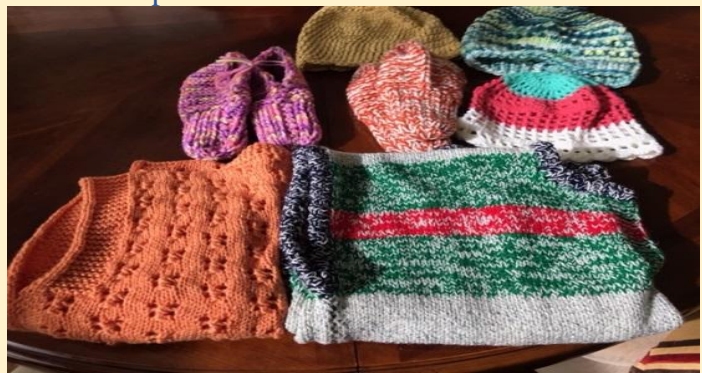
Handmade Sweaters, hats, Booties