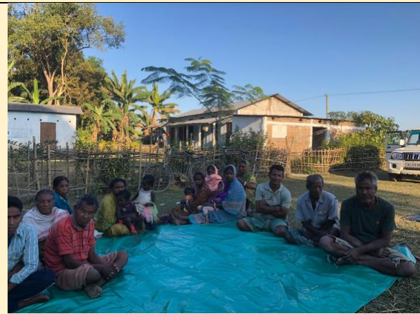
Tarps seem to be a key item for these places